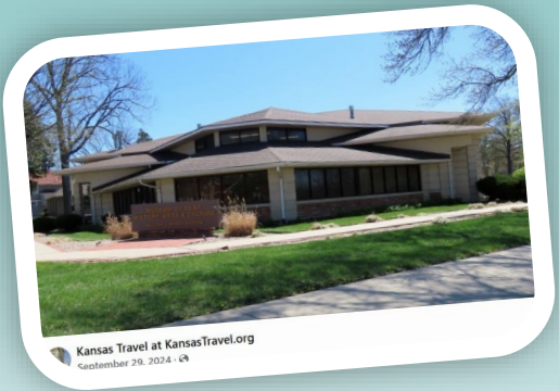
Kansas Travel at KansasTravel.org September 29, 2024 · 48

MDHAC was recognized in KansasTravel.org and posted in Facebook!