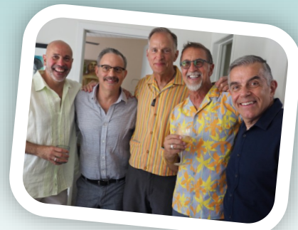
We cherish our donors!!